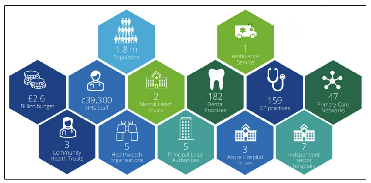
Figure 1: BOB ICS in numbers

Major changes are taking place in the way we organise health and care in Buckinghamshire, Oxfordshire and Berkshire West (BOB) promoting greater cooperation between organisations.